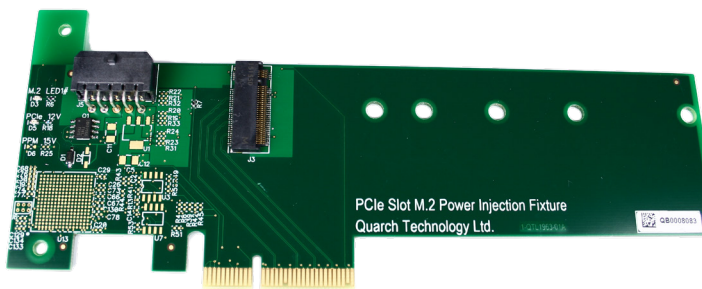
QTL1960 PCIe to M.2 Power Injection Fixture