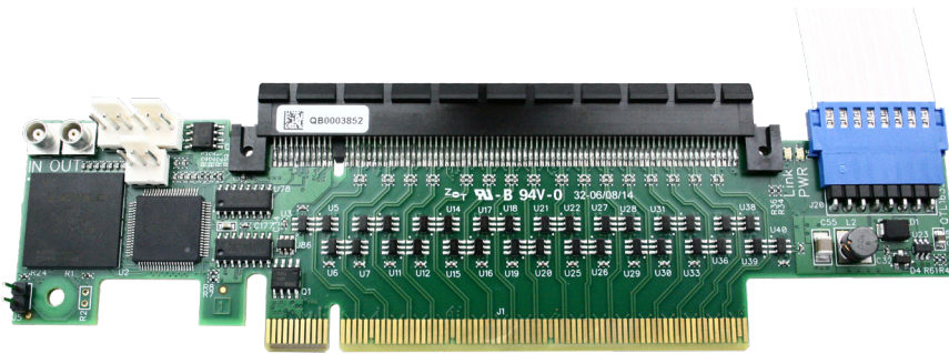
QTL1688 Card Module (with power injection)