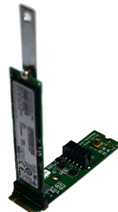
QTL2015 M.2 M-Key Injection Fixture