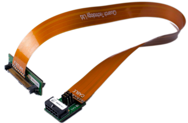
QTL1809 SFF Injection Fixture